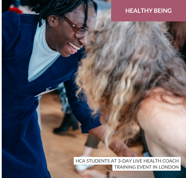
HCA STUDENTS AT 3-DAY LIVE HEALTH COACH TRAINING EVENT IN LONDON

Remember those playful moments - when we're fully in the present, curious, and creative - allowing us to reconnect with who we are at our core. It's not childish. It's actually one of the most human things we can do.