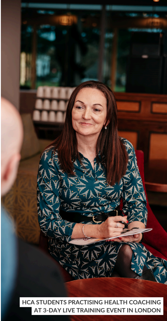
HCA STUDENTS PRACTISING HEALTH COACHING AT 3-DAY LIVE TRAINING EVENT IN LONDON